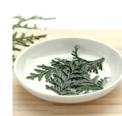
Kitayama Japanese Cypress Oil