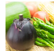
Beauty extract of Kyoto's Traditional Vegetable