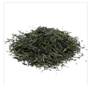
Uji Tea Extract