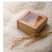
Fushimi's Pure Rice Ginjo Sake